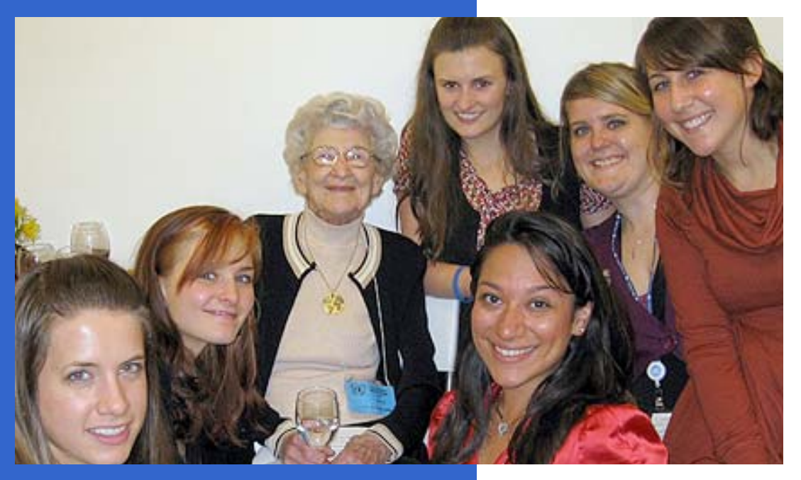
1947 greets 2008.

includes 10 representatives who are called on for assignment to UN offices and events in Geneva, Vienna, and Nairobi.